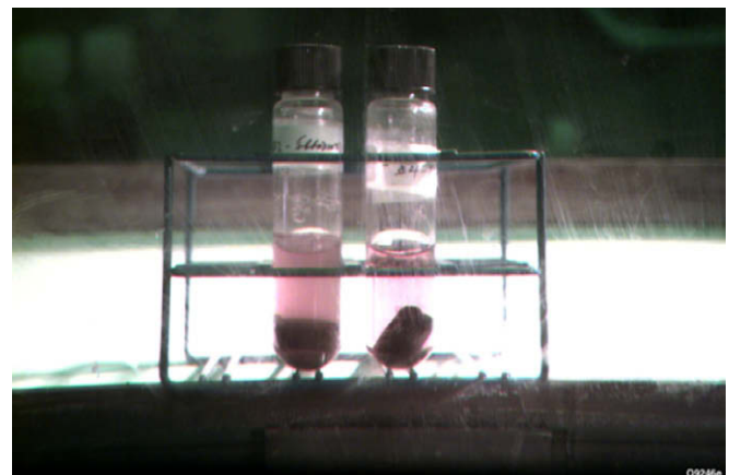
Fig. 2. Test vessels containing media and cladding segments in hot cell. The vessel on the left shows the cloudy media indicative of high biological activity after 34 days in cell for a total absorbed dose of 1.6 \times 10^3 Gy. The vessel on the right is a control containing a cladding segment and sterile media.